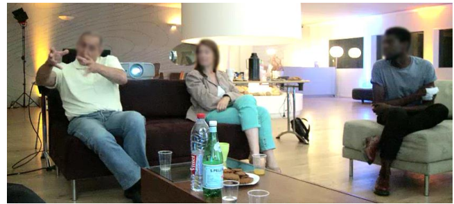
Figure 2: First group during the focus group session.

Although the discussion was oriented toward perceptions and impressions at first, visitors extensively talked about the understanding of the phenomena at play in the installation.